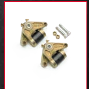
E-Z FLEX EQUALIZER & BOLT KIT