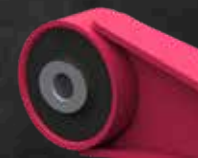
Patented Voidless Bushing