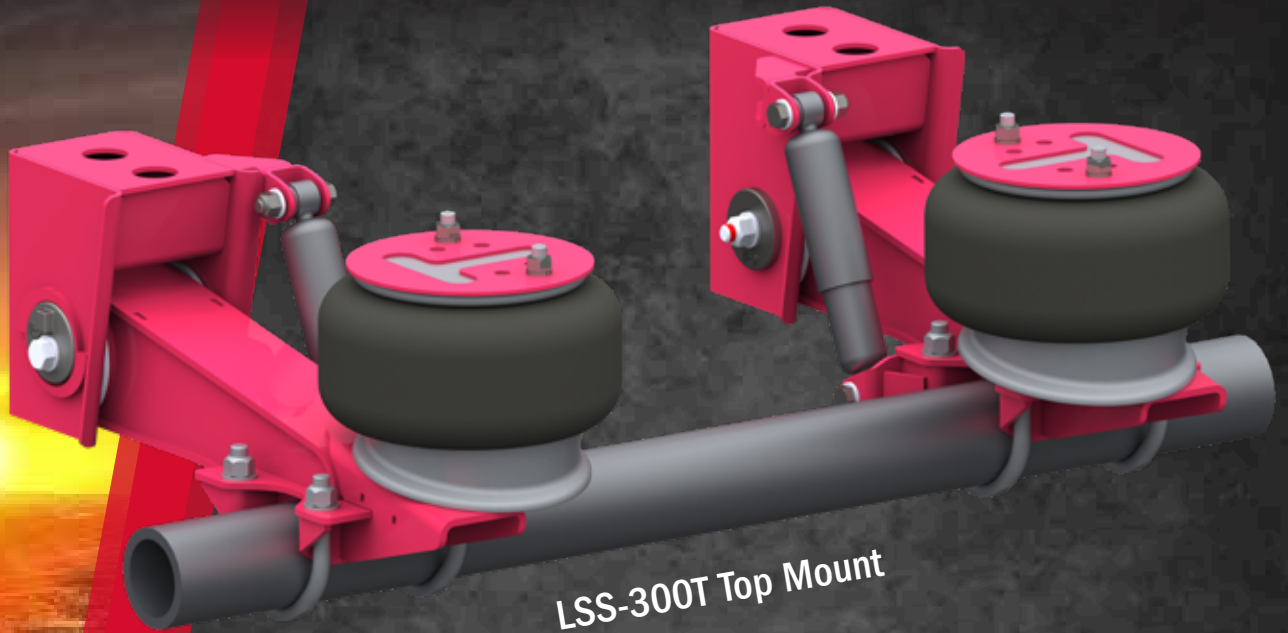
LSS-300T Top Mount

Loose suspension system option for maximum flexibility