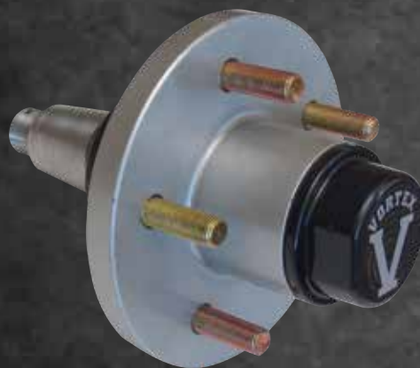
3.7K Eliminator Spindle with Vortex™